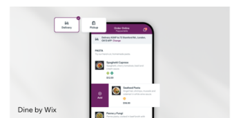
An App Designed for Your Customers